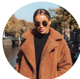
@NADIAANYA_ 221 K FOLLOWERS