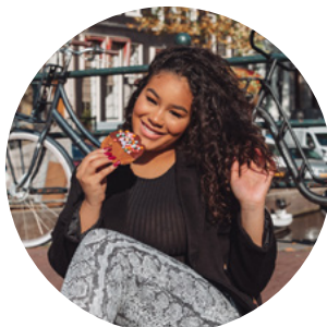
@YELENV 155 K FOLLOWERS