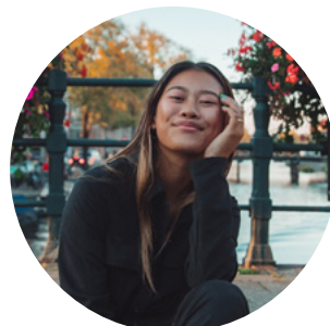
@PRETTYISICKLY 155 K FOLLOWERS