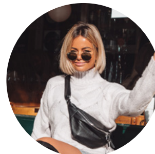
@SAFAALLOYD 22.4 K FOLLOWERS